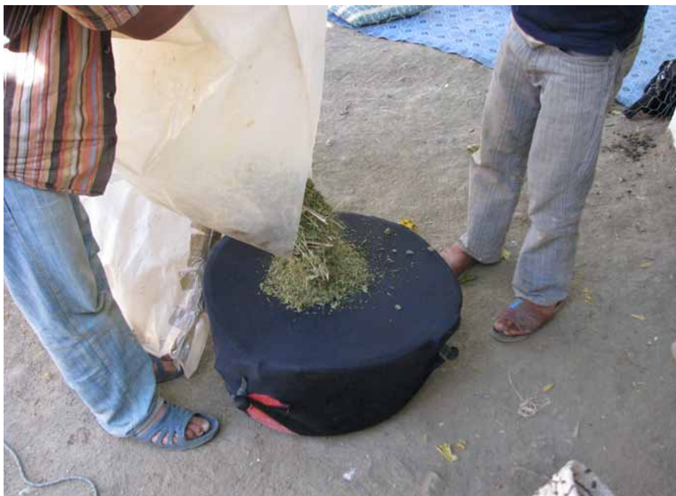
Preparing for sieving cannabis to manufacture hashish (Morocco, July 2009); Photo: Pien Metaal

of the regime, a like-minded group of countries might be able to generate a critical mass sufficient to compel states favouring the status quo to engage with the process. States and parts of the UN apparatus resistant to change might be more open to treaty modification or amendment if it was felt that such a concession would prevent the collapse of the control system. Helfer's analysis is: "[W]ithdrawing from an agreement (or threatening to withdraw) can give a denouncing state additional voice [...] by increasing its leverage to reshape the treaty [...] or by establishing a rival legal norm or institution together with other like-minded states." 39 Under such circumstances, subsequent changes may be an acceptable cost to nations favouring the basic architecture of the existing regime, but not willing to risk that its immutability could lead to its demise when countries would actually start to withdraw. 40