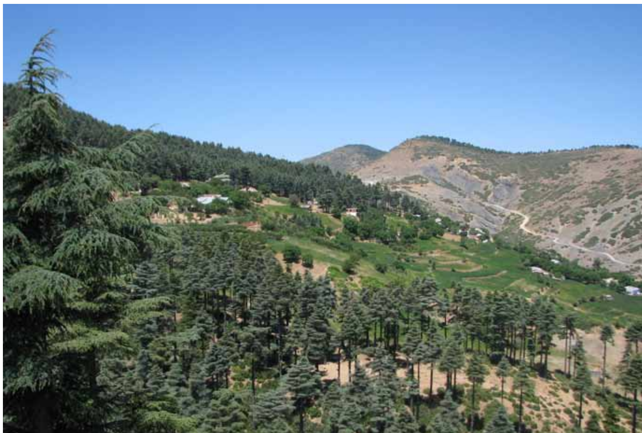
Cannabis in the Rif mountains (July 2009).

49”. 20 The difference would be that while reservations made under article 49 are automatically accepted, other parties can raise objections to reservations made under the conditions of article 50. If one-third or more of the parties object, the reservation would not be permitted.